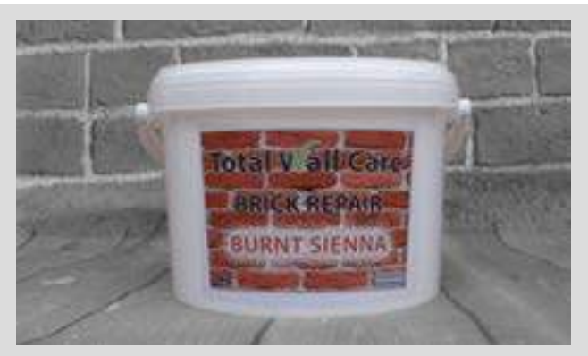
Brick Repair Mortar

A range of high quality products for colour matched repairs to brick and natural stone elements. All of the products enable the existing colour to be matched or changed without affecting the substrate's ability to breathe.