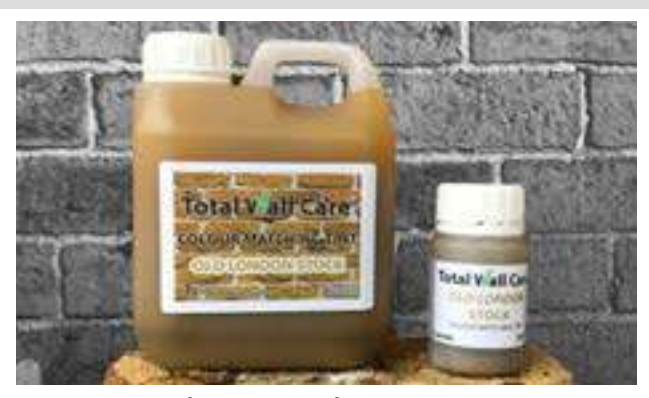
Colour Matching Tints

The mortar is extremely workable enabling the recreation of contours and profiles, and surface textures. It is a perfect solution for refacing crumbling bricks, and repairing chips and impact damage. Available in a range of colours and sizes.