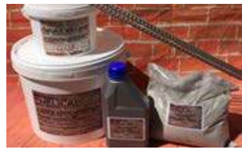
CRACK STITCHING KIT

HelicalFix Crack Stitching Kits contain all the materials needed for reconnecting and repairing cracks in brick, block and stone walls.