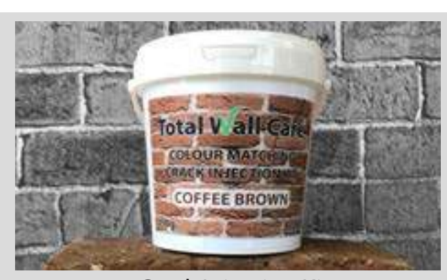
Crack Injection Kit

The mortar is extremely workable enabling both smooth and textured finishes with appropriate tooling techniques.