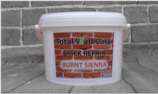
Brick Repair Mortar

A range of high quality products for colour matched repairs to brick and natural stone elements. All of the products enable the existing colour to be matched or changed without affecting the substrate's ability to breathe.