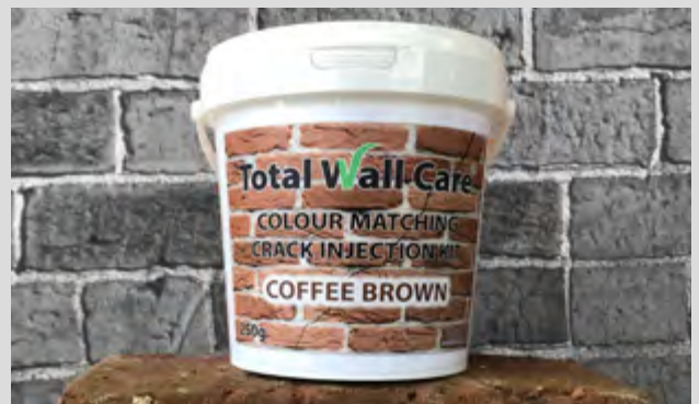
Crack Injection Kit

Simply shake to use, permanent brick tint. For staining mismatched bricks, replicating ageing and discolouration, to recolouring entire buildings. Can be used on brick, porous natural stone, concrete and mortar beds. Available in a range of sizes, colours and grades, as well as Soot Wash and Lime Wash.