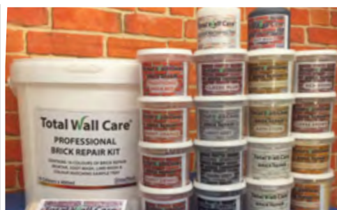
Professional Brick Repair Kit

Enables the trade professional to create their own shades of brick dye for staining brick, natural stone, concrete and mortar. Contains 4 x 1L of Base Tinting Fixative (makes 12L fully diluted) and 14 x 75ml of pigments.