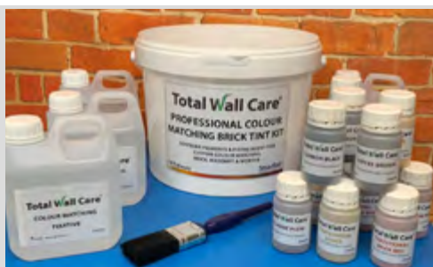
Professional Brick Tint Kit

Please see website for full range of colours and current special offers!