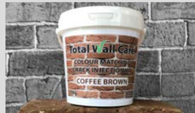
Crack Injection Kit

Simply shake to use, permanent brick tint. For staining mismatched bricks, replicating ageing and discolouration, to recolouring entire buildings. Can be used on brick, porous natural stone, concrete and mortar beds. Available in a range of sizes, colours and grades, as well as Soot Wash and Lime Wash.