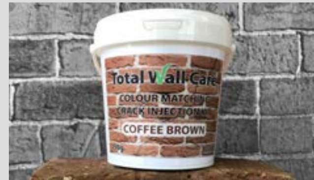
Crack Injection Kit

Simply shake to use, permanent brick tint. For staining mismatched bricks, replicating ageing and discolouration, to recolouring entire buildings. Can be used on brick, porous natural stone, concrete and mortar beds. Available in a range of sizes, colours and grades, as well as Soot Wash and Lime Wash.