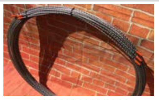
LONG HELICAL BARS

HelicalFix high tensile, austenitic stainless steel, 10m long helical bars used for bed joint reinforcement.