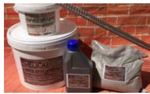
CRACK STITCHING KIT

HelicalFix Crack Stitching Kits contain all the materials needed for reconnecting and repairing cracks in brick, block and stone walls.