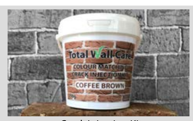
Crack Injection Kit

The mortar is extremely workable enabling both smooth and textured finishes with appropriate tooling techniques.