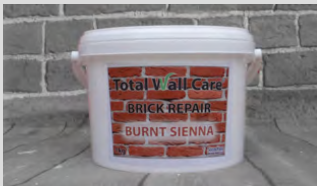
Brick Repair Mortar

A range of high quality products for colour matched repairs to brick and natural stone elements. All of the products enable the existing colour to be matched or changed without affecting the substrate's ability to breathe.