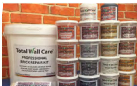
Professional Brick Repair Kit

Enables the trade professional to create their own shades of brick dye for staining brick, natural stone, concrete and mortar. Contains 4 x 1L of Base Tinting Fixative (makes 12L fully diluted) and 14 x 75ml of pigments.