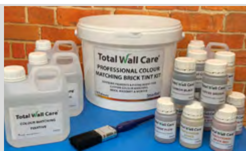
Professional Brick Tint Kit

Please see website for full range of colours and current special offers!