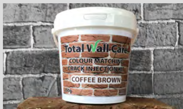
Crack Injection Kit

Available in a range of sizes, colours and grades, as well as Soot Wash and Lime Wash.