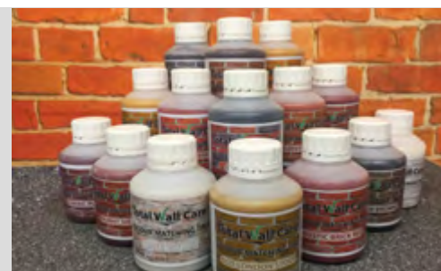
Brick Tint Multi-Packs

Contains 400ml all 16 Colours of Brick Repair Mortar along with Soot Wash and Lime Wash. It's a excellent kit for carrying out small repairs and sample/test panel repairs.