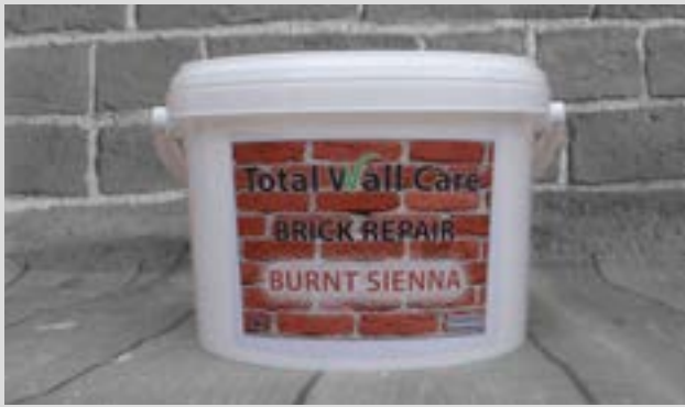
Brick Repair Mortar

A range of high quality products for colour matched repairs to brick and natural stone elements. All of the products enable the existing colour to be matched or changed without affecting the substrate's ability to breathe.