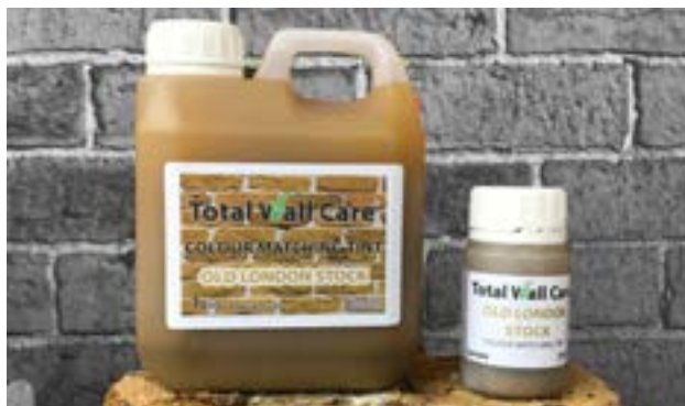
Colour Matching Tints

Available in a range of sizes, colours and grades, this high quality, lime-based pointing mortar is ready to use once mixed with water. The mortar is extremely workable enabling both smooth and textured finishes with appropriate tooling techniques.