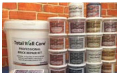
Professional Brick Repair Kit

Enables the trade professional to create their own shades of brick dye for staining brick, natural stone, concrete and mortar. Contains 4 x 1L of Base Tinting Fixative (makes 12L fully diluted) and 14 x 75ml of pigments.