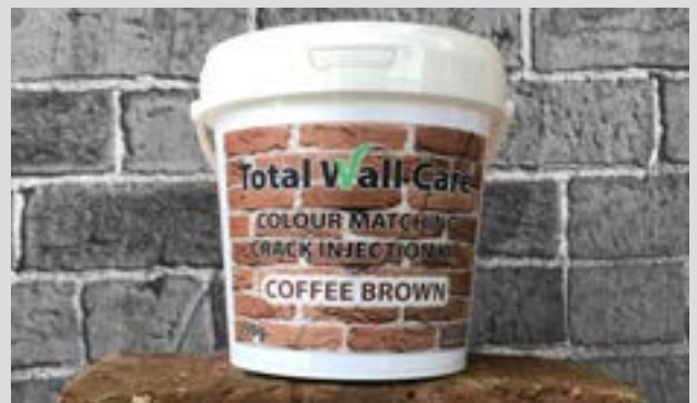
Crack Injection Kit

Simply shake to use, permanent brick tint. For staining mismatched bricks, replicating ageing and discolouration, to recolouring entire buildings. Can be used on brick, porous natural stone, concrete and mortar beds. Available in a range of sizes, colours and grades, as well as Soot Wash and Lime Wash.