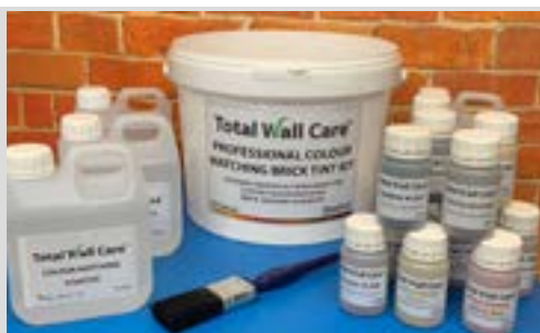
Professional Brick Tint Kit

Please see website for full range of colours and current special offers!