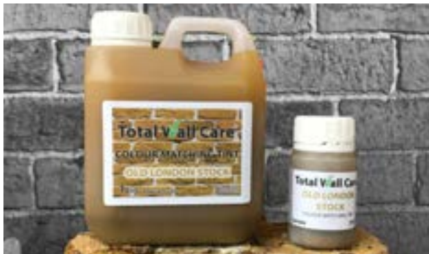
Colour Matching Tints

Available in a range of sizes, colours and grades, this high quality, lime-based pointing mortar is ready to use once mixed with water. The mortar is extremely workable enabling both smooth and textured finishes with appropriate tooling techniques.