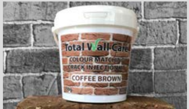
Crack Injection Kit

Simply shake to use, permanent brick tint. For staining mismatched bricks, replicating ageing and discolouration, to recolouring entire buildings. Can be used on brick, porous natural stone, concrete and mortar beds. Available in a range of sizes, colours and grades, as well as Soot Wash and Lime Wash.