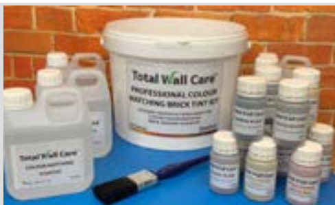
Professional Brick Tint Kit

Please see website for full range of colours and current special offers!