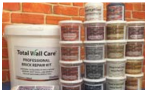
Professional Brick Repair Kit

Enables the trade professional to create their own shades of brick dye for staining brick, natural stone, concrete and mortar. Contains 4 x 1L of Base Tinting Fixative (makes 12L fully diluted) and 14 x 75ml of pigments.