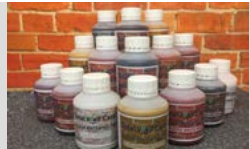
Brick Tint Multi-Packs

Contains 400ml all 16 Colours of Brick Repair Mortar along with Soot Wash and Lime Wash. It's a excellent kit for carrying out small repairs and sample/test panel repairs.