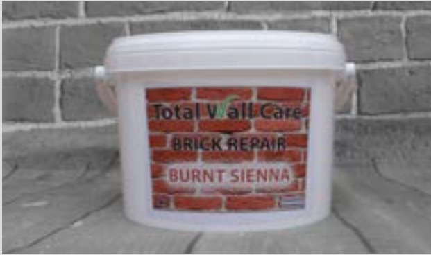
Brick Repair Mortar

A range of high quality products for colour matched repairs to brick and natural stone elements. All of the products enable the existing colour to be matched or changed without affecting the substrate's ability to breathe.